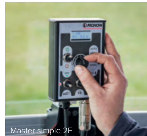
Master simple 2F