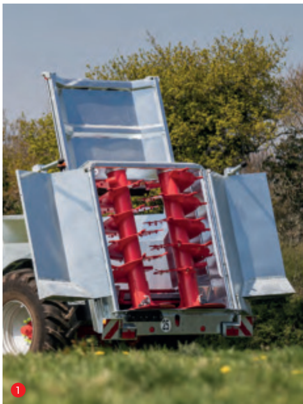
1 | Hydraulic rear door