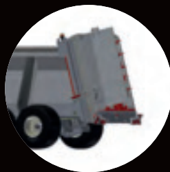
REDUCED WORKING WIDTH