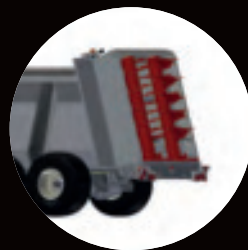
FULL WORKING WIDTH