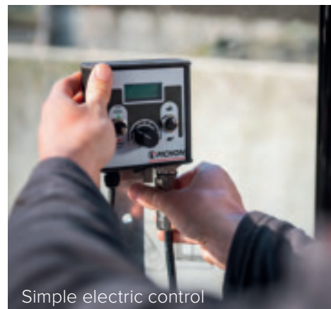
Simple electric control